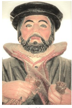
William Lamb 450th anniversary