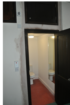
Before (top far left), Maciej Osiecki at work (bottom far left) and the finished toilet (left).

The re-ordering work finally began in January with the installation of a second toilet in Church. The building work, carried out by Darren Newman with Maciej Osiecki doing the carpentry, is now complete and all that is needed is a lick of paint to complete the job. So the days of queuing for the toilet are past and we have some new storage space to boot! Go and have a look next time you are in Church.